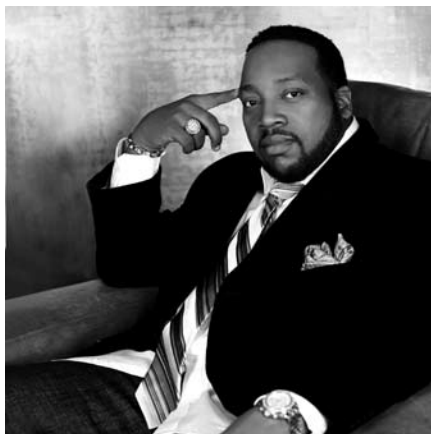
The annual Gospel Fest concert will feature well-known gospel singer Marvin Sapp

See page 3 for highlights of Black History Month.