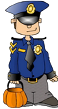
Catch the buzz from you very own fuzz