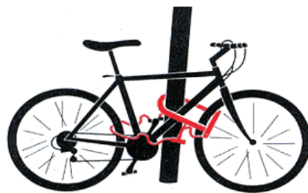
Locking without wheel removal

Position your bike frame and wheels so that you fill up or take up as much of the open space within the lock's U portion as possible. The tighter the lock up, the harder it will be for a thief to insert a pry bar and pry open your lock. Notice here that 2 different locks are used.