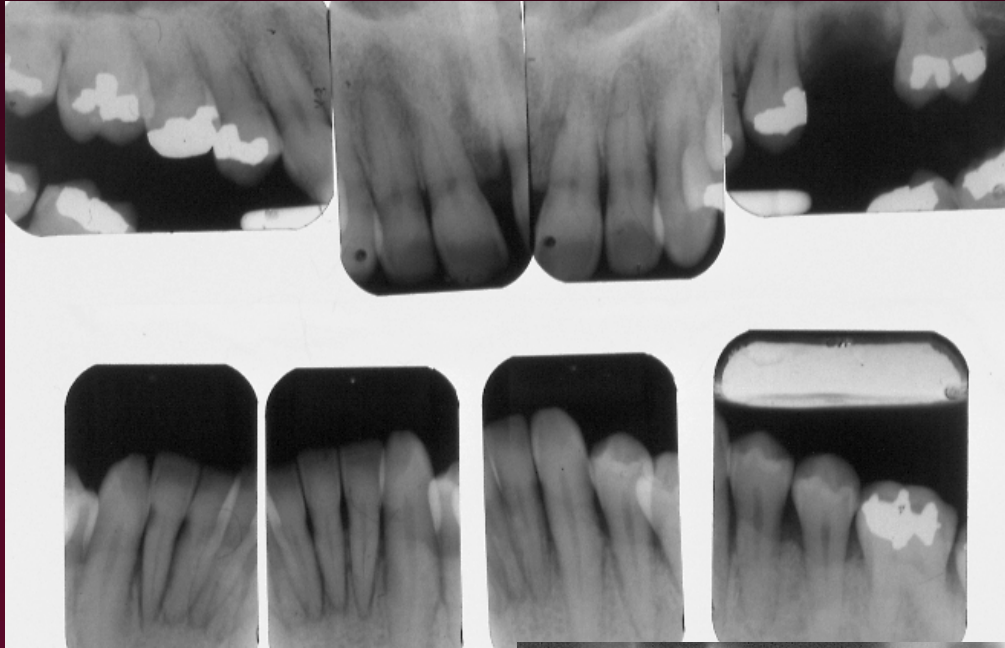
Widened PDL spaces